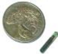
Microchip shown actual size

Microchipping is an easy, safe and permanent way of identifying pets. When injured animals are brought to us, we are always relieved if they are microchipped, as we can immediately ring their owner to make decisions about the best care for the pet. If you would like to know more about microchipping, talk to one of our veterinary staff.