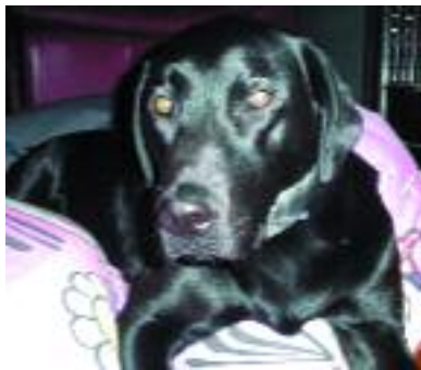
Meg relaxing at home